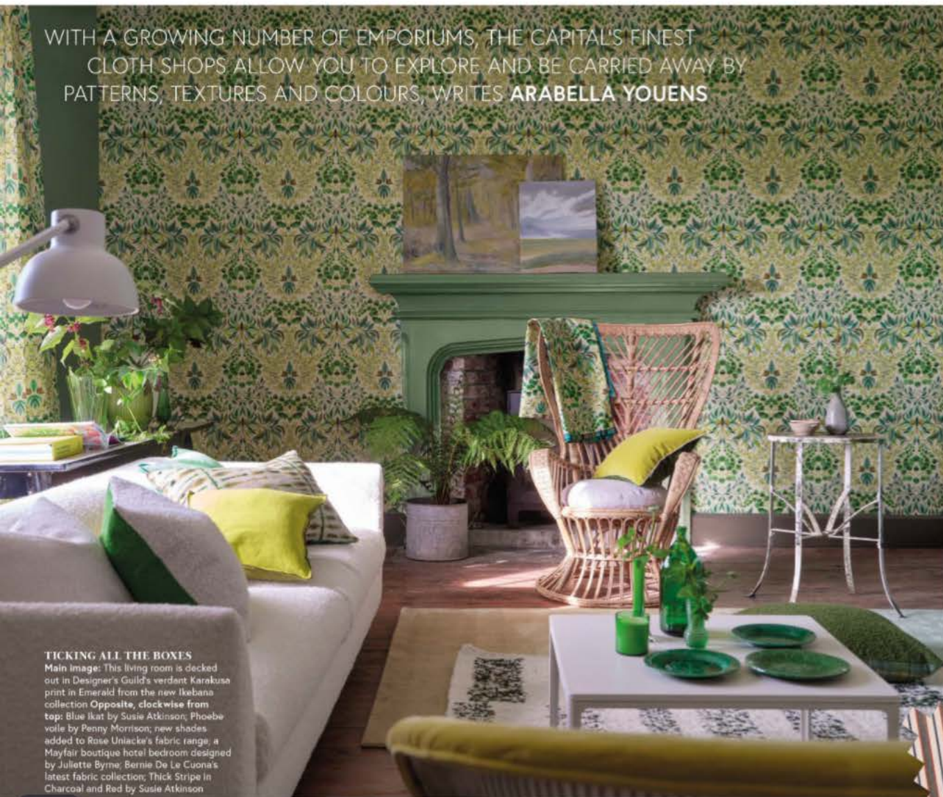
TICKING ALL THE BOXES Main image: This living room is decked out in Designer's Guild's verdant Karakusa print in Emerald from the new Ikebana collection. Opposite, clockwise from top: Blue Ikat by Susie Atkinson; Phoebe voile by Penny Morrison; new shades added to Rose Uniacke's fabric range; a Mayfair boutique hotel bedroom designed by Juliette Byrne; Bernie De Le Cuona's latest fabric collection; Thick Stripe in Charcoal and Red by Susie Atkinson

WITH A GROWING NUMBER OF EMPORIUMS, THE CAPITAL'S FINEST CLOTH SHOPS ALLOW YOU TO EXPLORE AND BE CARRIED AWAY BY PATTERNS, TEXTURES AND COLOURS, WRITES ARABELLA YOUENS